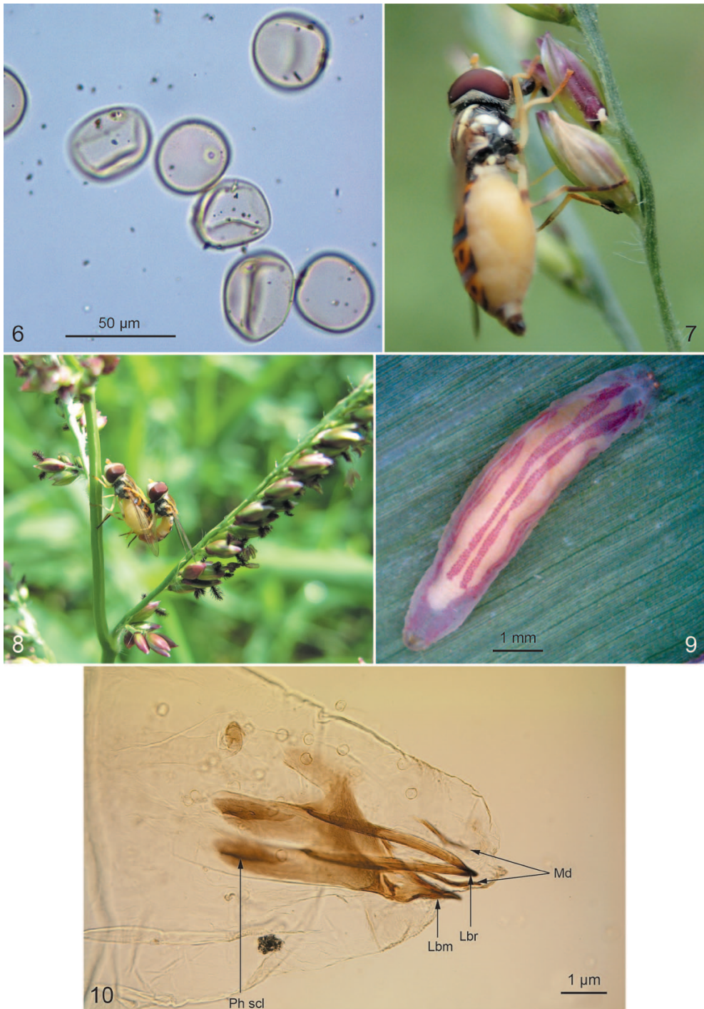
Fig. 6-10. – Toxomerus pulchellus (Macquart). – 6, Pollen grains of Para grass ingested by larvae. – 7, Female feeding on pollen from a spikelet of Para grass (11.I.2013, Croix-Rivail, Ducos). – 8, Copulating pair on a panicle of Para grass. – 9, Third stage larva. – 10, Cephalopharyngeal skeleton ( Lbm , labium; Lbr , labrum; Md , mandible; Ph scl , pharyngeal sclerite). (Photos: 6, S. Muller; 7, M.-C. Lefrançois; 8-9, E. Dumbardon-Martial; 10, V. Balmes).